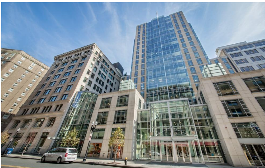
Left: 75 Arlington Street Right: 10 St. James Avenue

Mori Trust Group owns 124 real properties for management and leasing, including offices, hotels and residences, primarily in central Tokyo. Recently, we started construction of the Tokyo World Gate (a total floor area of about 2,150,000 square feet), which is the first project accredited as an architectural structure for National Strategy Urban Planning. In addition to domestic projects like this, we will also pursue a policy of promoting investments in real estate in the US. We intend to expand the total amount of investments overseas to between 100 billion yen and 200 billion yen in the future.