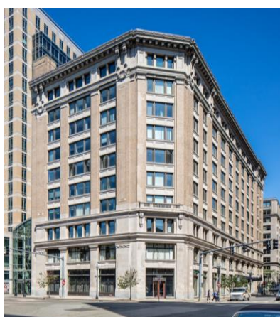
75 Arlington Street