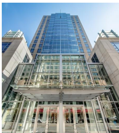
10 St. James Avenue

10 St. James Avenue won “BOMA Boston 2016 TOBY (the Outstanding Building of the Year) & Industry Awards,” one of the greatest programs in the US to recognize commercial real estate, and have garnered an extremely high reputation for their function, design and other aspects.