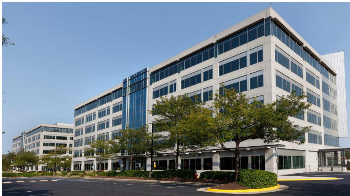
Exterior view of the acquired office building